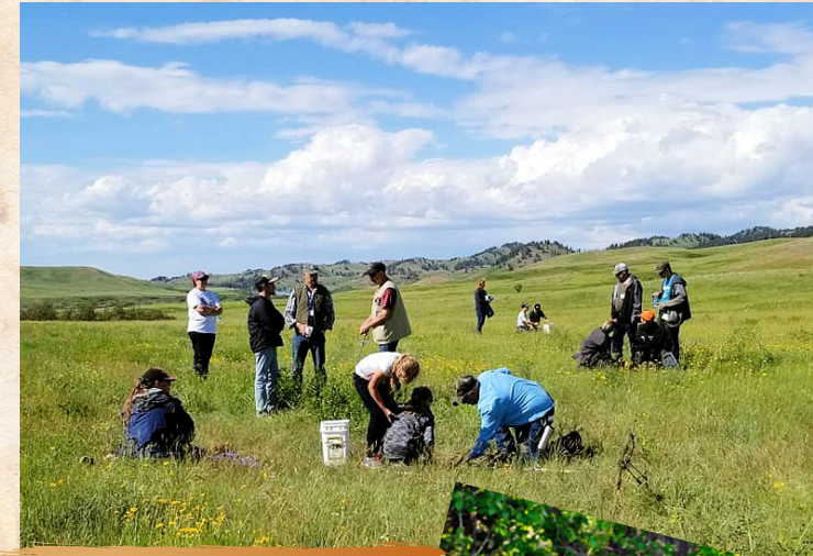
YOUTH TRAPPER CAMP